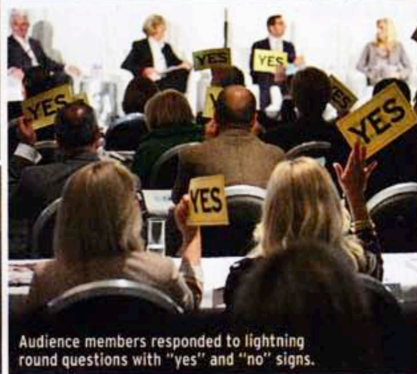
Audience members responded to lightning round questions with "yes" and "no" signs.