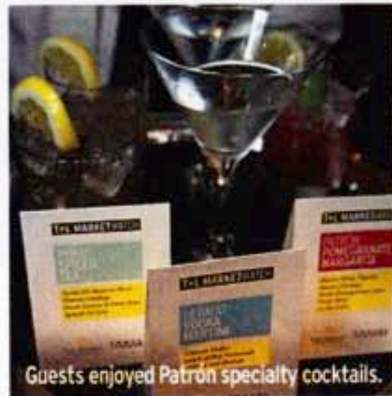
Guests enjoyed Patrón specialty cocktails.

{ TRAVEL + LEISURE • PROMOTIONS • EVENTS • OFFERS }