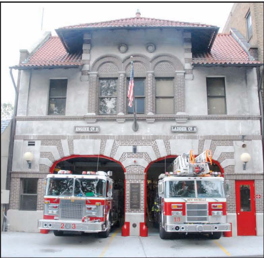
Happy 100th Birthday to NRFD Fire Station 3