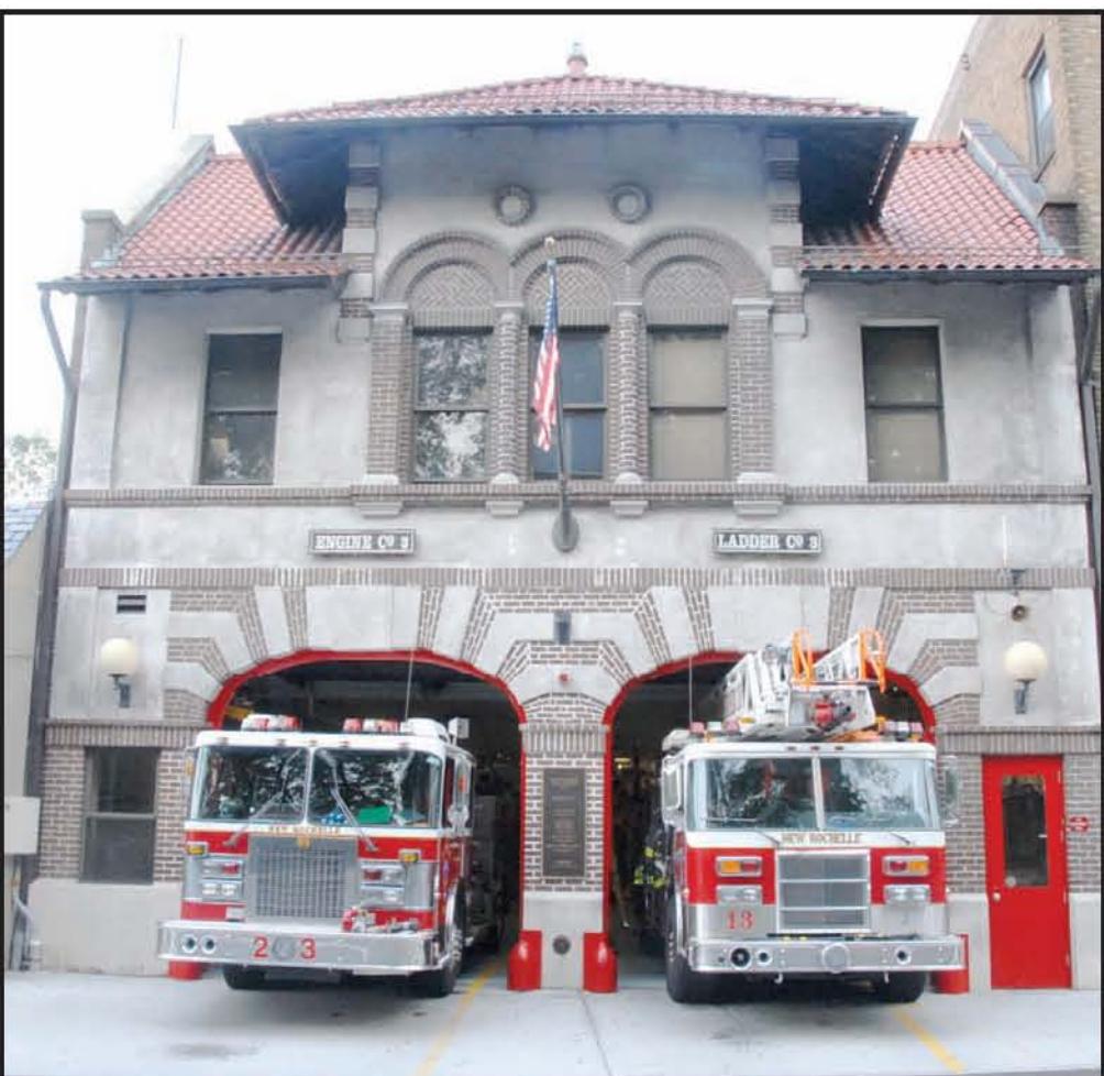
Happy 100th Birthday to NRFD Fire Station 3