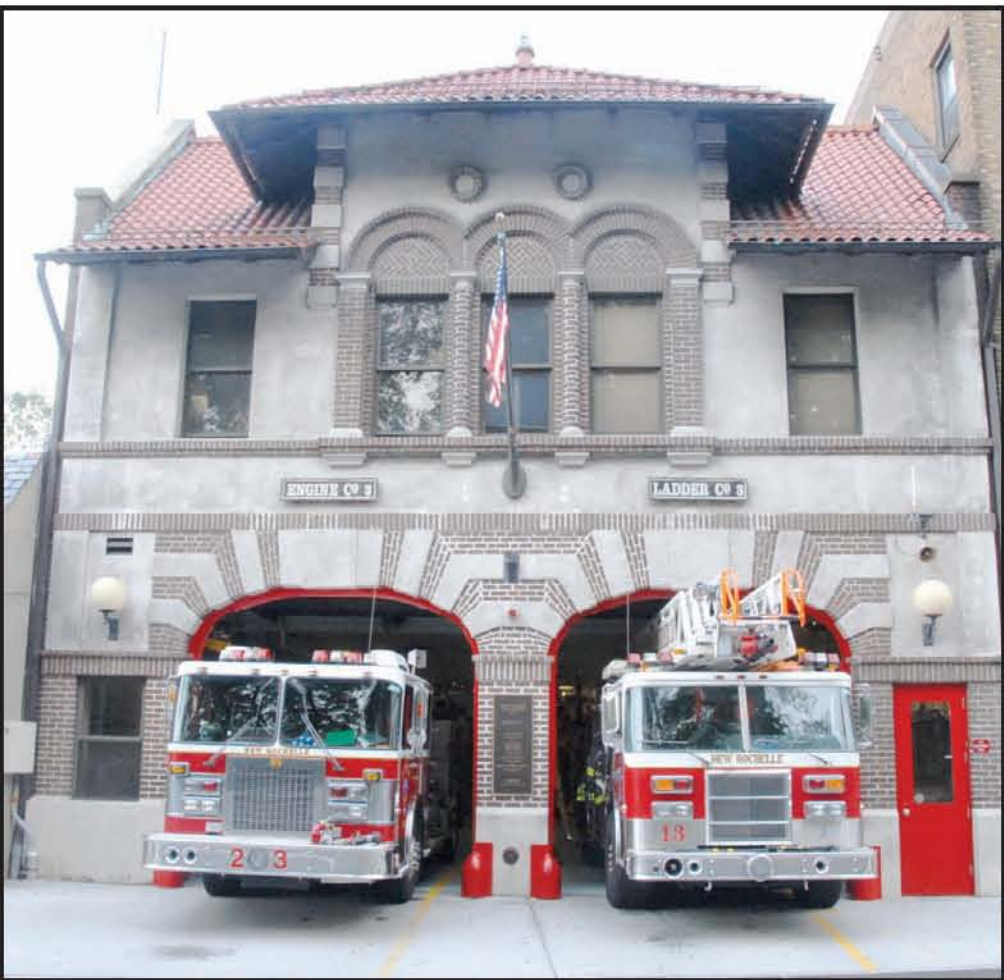
Happy 100th Birthday to NRFD Fire Station 3