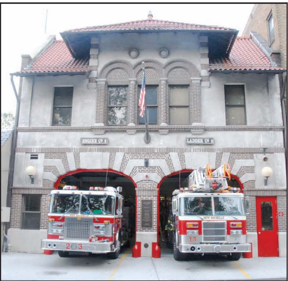
Happy 100th Birthday to NRFD Fire Station 3