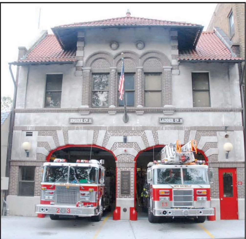
Happy 100th Birthday to NRFD Fire Station 3