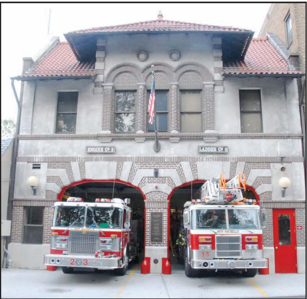
Happy 100th Birthday to NRFD Fire Station 3